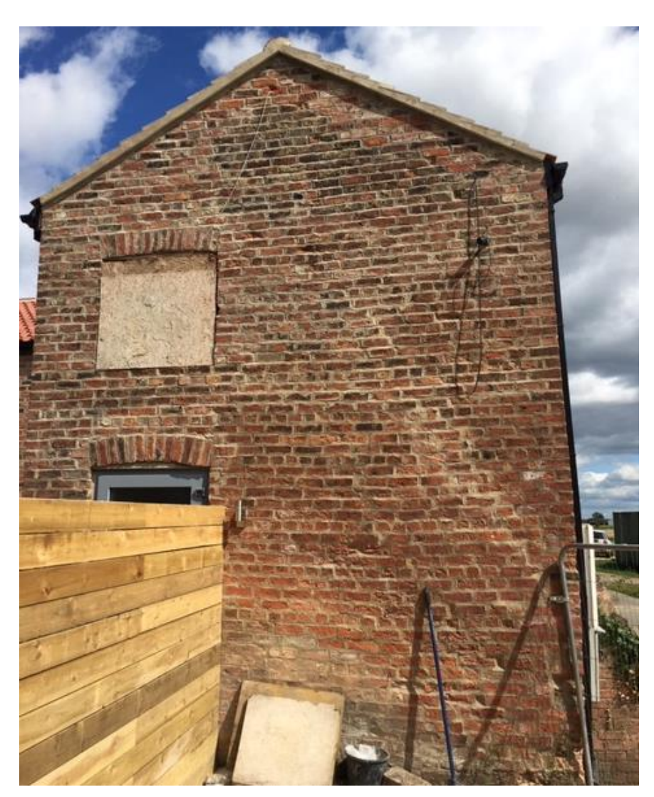
View of the south and west elevation