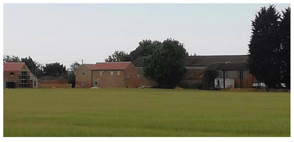
View looking south looking towards the site