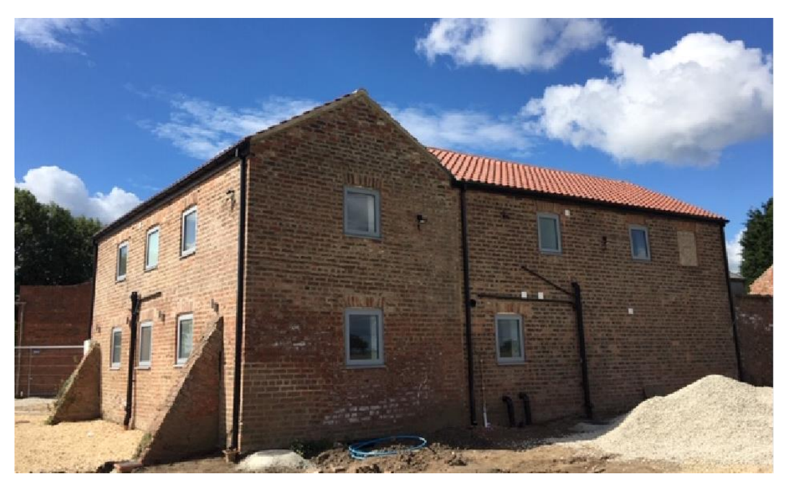
View of the north and east elevations from the highway