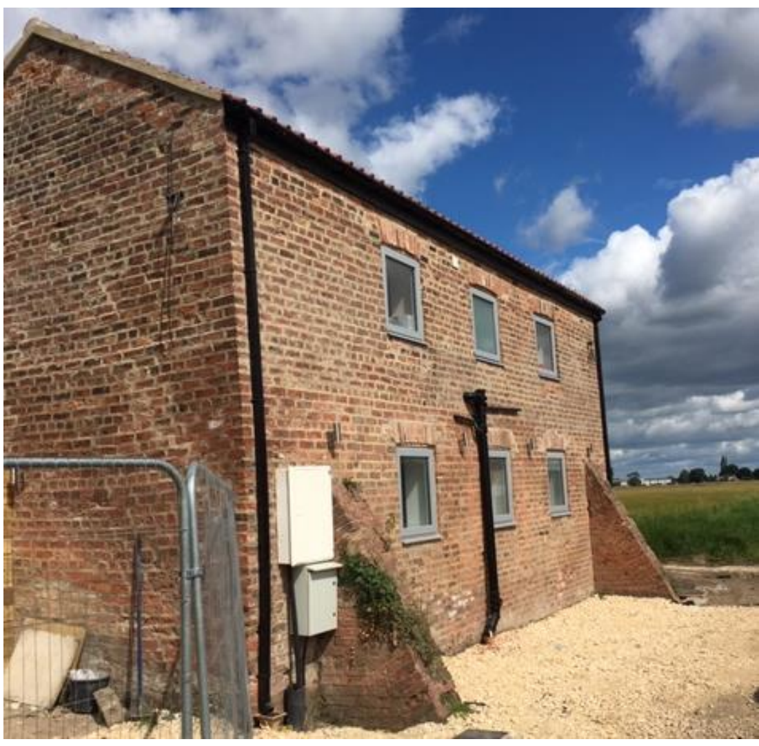
View of the east elevation