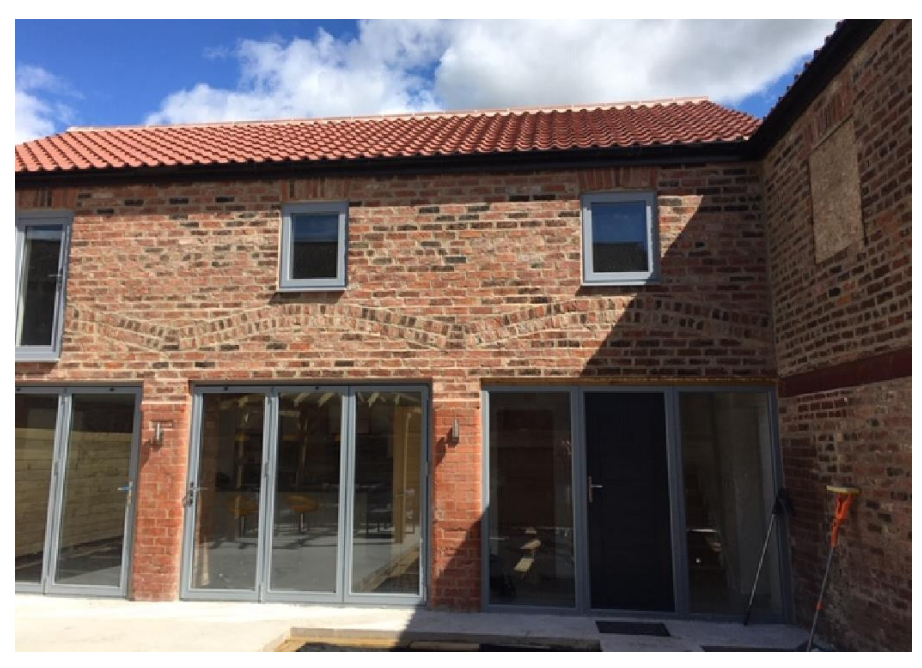
View of the south and west elevations